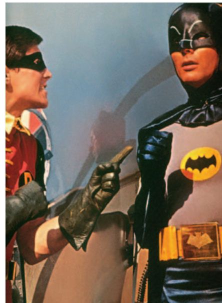
SOME OF THE GREAT TWOSOMES FEATURED IN THE BOOK OF DUOS .